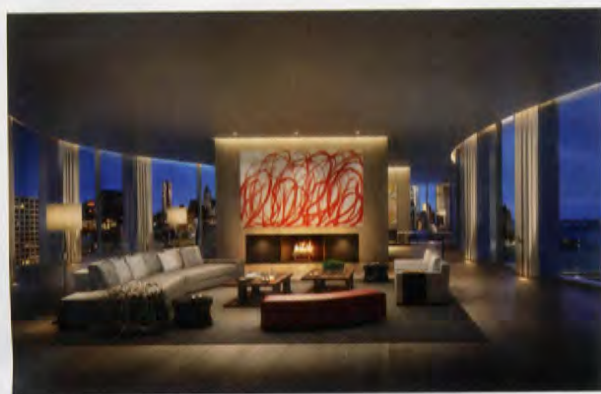
Above: the living room of the penthouse at 160 Leroy in Manhattan's West Village, $80m