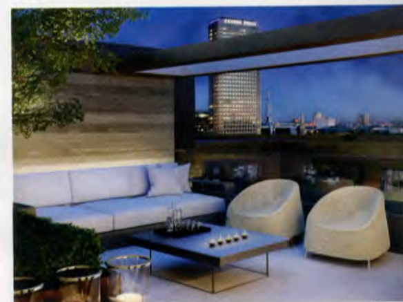
Above: a terrace at Rathbone Square, Fitzrovia, penthouses from £4.475m

CHRISTIE'S INTERNATIONAL REAL ESTATE (CIREX) ASSOCIATE, ONE RIVER POINT