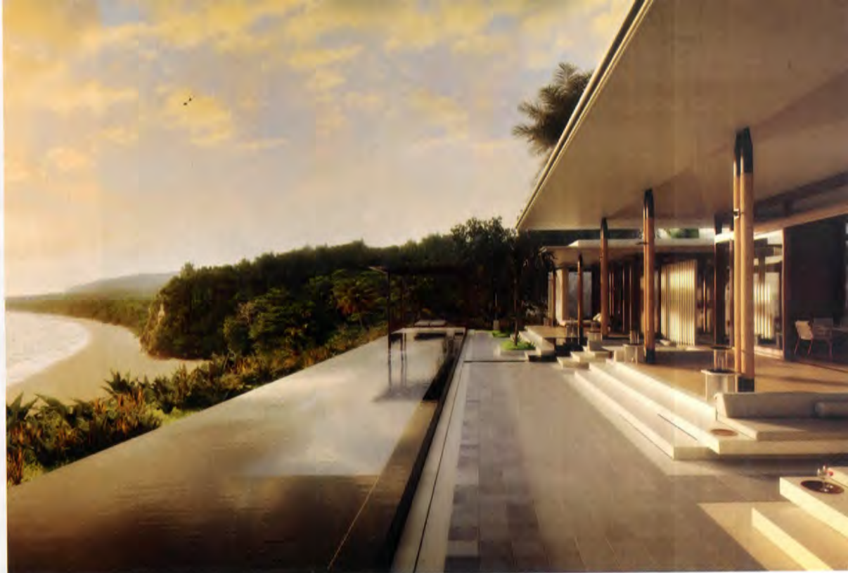
Above: an Amanera Founder Villa at the Playa Grande Club & Reserve, Dominican Republic, villas from £4m. Below: One River Point in Miami, residences from $750,000

🌐 Across the Atlantic, Aman Resorts , famed for its ne plus ultra holiday offering, has chosen to launch its first golfing project in the DOMINICAN REPUBLIC , a Caribbean island now something of a mecca for those targeting a hole in one. A natural rainforest preserve framed by mountainous jungle and poised on 60ft cliffs, The Playa Grande Club & Reserve ( www.playagrande.com ; from $4m) has a Robert Trent Jones Sr-designed course, a mile-long stretch of untouched sand and, of course, all the luxury facilities