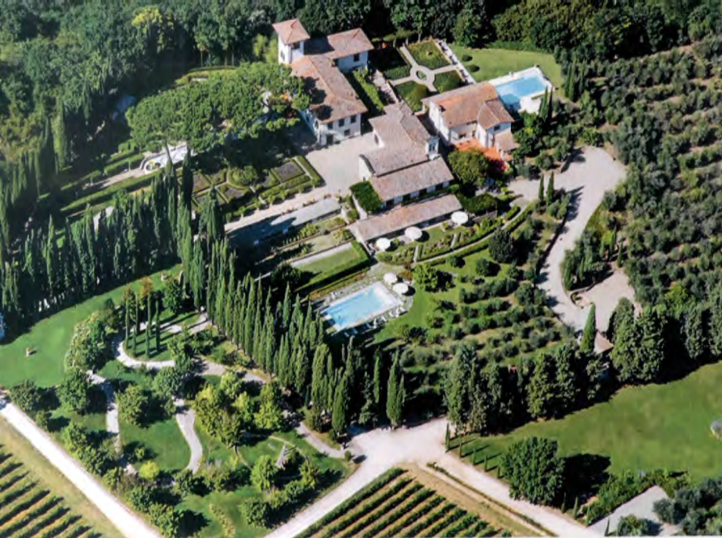
Above: Tuscan Chianti Estate in Tuscany, €17.15m. Below: the living room of a three-bedroom property at Les Résidences du Plein Air, Loire Valley, prices start at €2.3m

question has been envisioned by one of the world's leading architects. Rathbone Square ( www.rathbonesquare.co.uk ; penthouses from £4.475m), just north of Oxford Street in Fitzrovia, has been designed by Make Architects, whose founder, Ken Shuttleworth, is the defining hand behind such iconic landmarks as the Wembley Stadium arch, The Gherkin and the Millennium Bridge. One of the first to be created in the city centre for more than 100 years, the square will, on its completion in 2018, be a real live-work space, open to the public during the day, but allowing owners of the 142 sleek apartments to have it to themselves at night – along with the private pool, screening room, wine cellar and lounge.