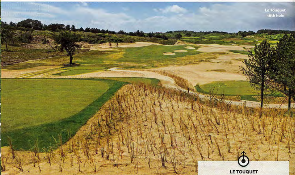
Le Touquet 16th hole